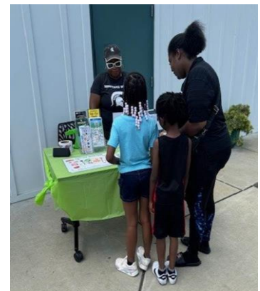
Youth at DPFLI Family Fun day